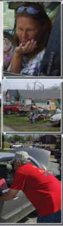
Survivors talk with staff of God's Pit Crew about one of the tornadoes that came through Mena.

The American Bible Society sent Bibles for distribution to the tornado survivors in Mena, AR. Good reports continue to come in about the calming effects of those scriptures.